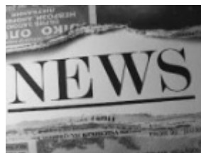
CHA/PA In the News