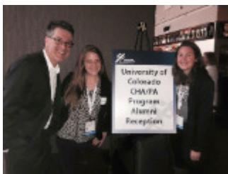
CHA/PA Alumni Reception