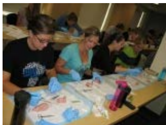
Suturing Workshop - 2nd Year Students